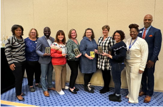
2023 Academy Awardees, Learning Forward CEO, and Learning Forward Foundation Members

Thank you to those who joined us in person or in spirit at the recent Learning Forward Foundation donor event. What a wonderful evening of learning and celebration of our donors and our scholarship awardees.